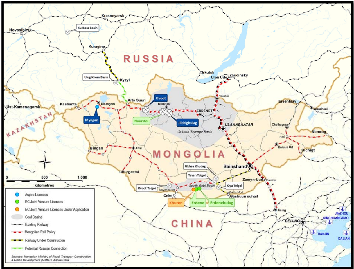
Figure 2: Nuurstei project location alongside the Erdneet – Ovoot railway