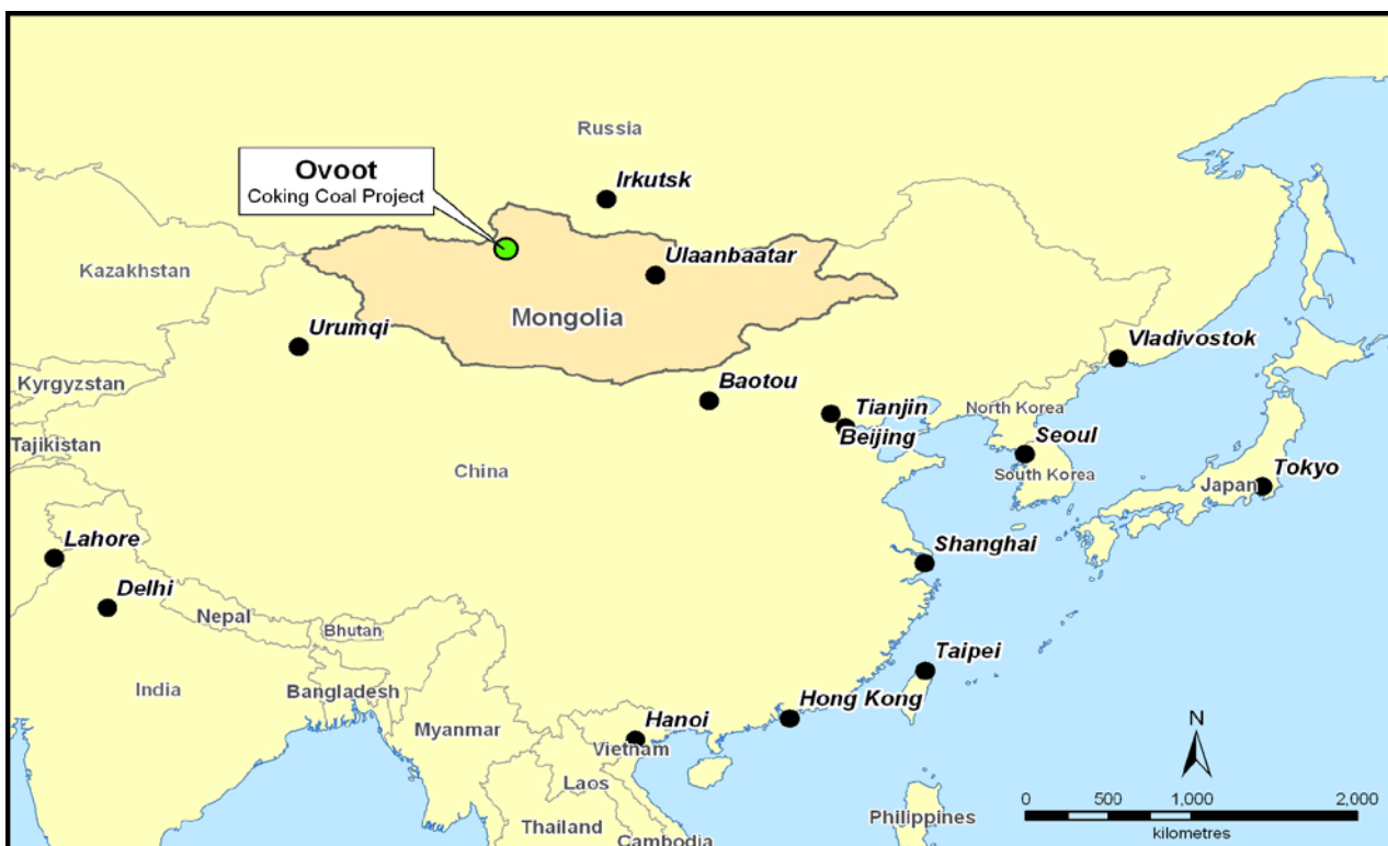
Figure 1 - Location Map – Ovoot Coking Coal Project

Ovoot is potentially a world class coking coal project, located in the Khuvsgul Province in North-West Mongolia and in close proximity to China (refer Figure 1).