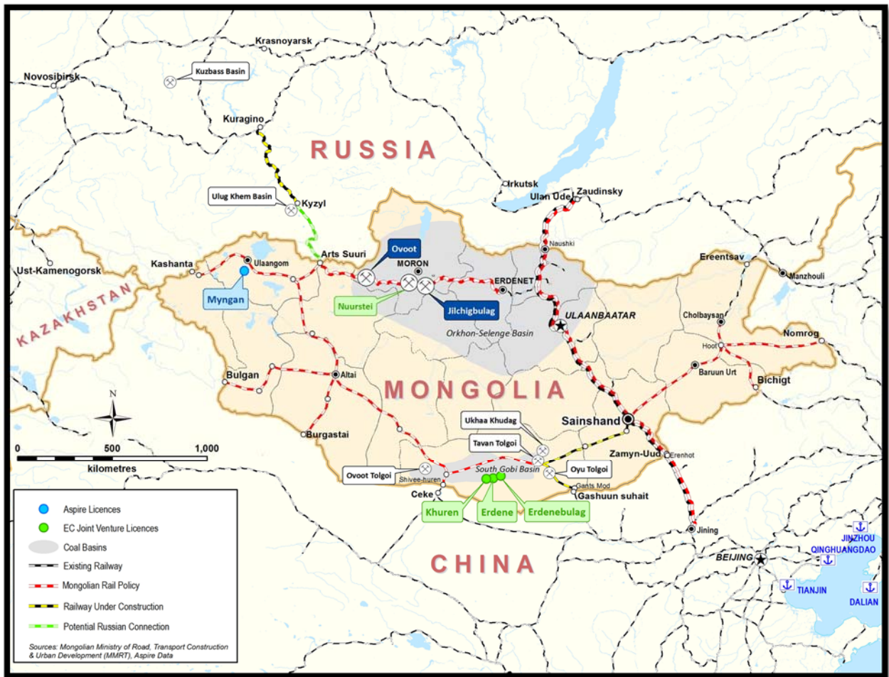
Figure 1: Location of Projects and New Projects

Preliminary work to be undertaken by field investigations in 2015 will include surface mapping and sampling to enable drill hole identification.