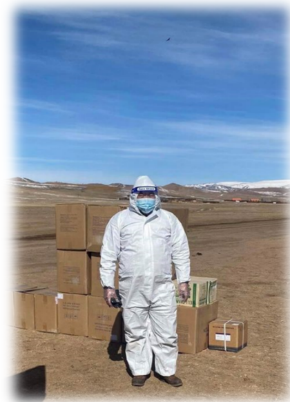
Picture 14: The company handed over donation in full protective gear due to strict lockdown

The delivery of the items were made by company in- person. Staffs went through a demanding process of obtaining special permission slips from the National Emergency Authority of Mongolia and PCR diagnosis of COVID-19 test results.