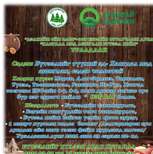
Picture 8: Advertisement for Delgermurun Forest Authority of Khuvsgul aimag

Additionally, the company also co-sponsored a toy making competition from recycled food among high school students in soum schools in the vicinity of Khuvsgul aimag Delgermurun Forest Authority Area, within the scope of the International Forest Day upon the respective Khuvsgul aimag authority's request for support.