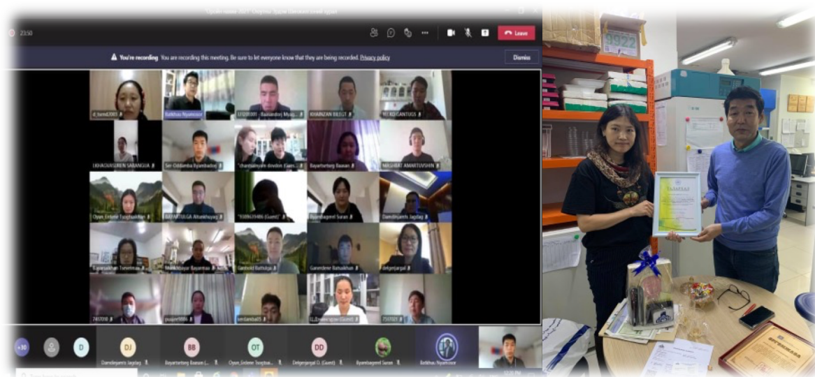
Picture 4: A Certificate of Gratitude being awarded to the company representative

NUM expressed their sincere gratitude to the company representative and awarded the company a certificate of gratitude.