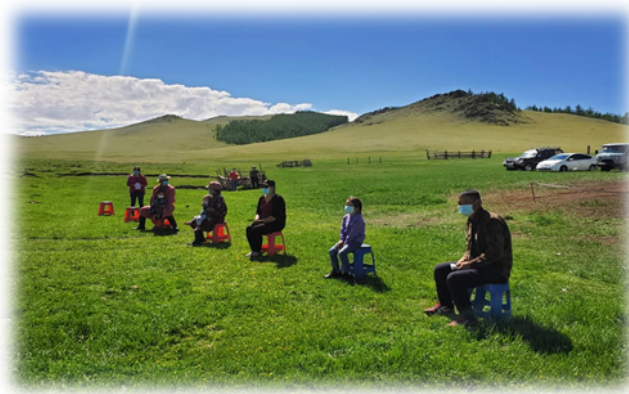
Picture 15: Mobile Cardiac Clinic for the Tsetserleg and Tsagaan-Uul communities of Khuvsgul aimag