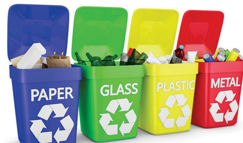
Picture 17: Recycling bins to be placed in UB office building by company initiative

The company is working with the JJ Tower Building administration to make the Office a Green Office, by pioneering waste recycling initiative. Within the framework of the initiative, sets of recycling bins will be set on each floor of the 10 story JJ Tower Building hallways and outside.